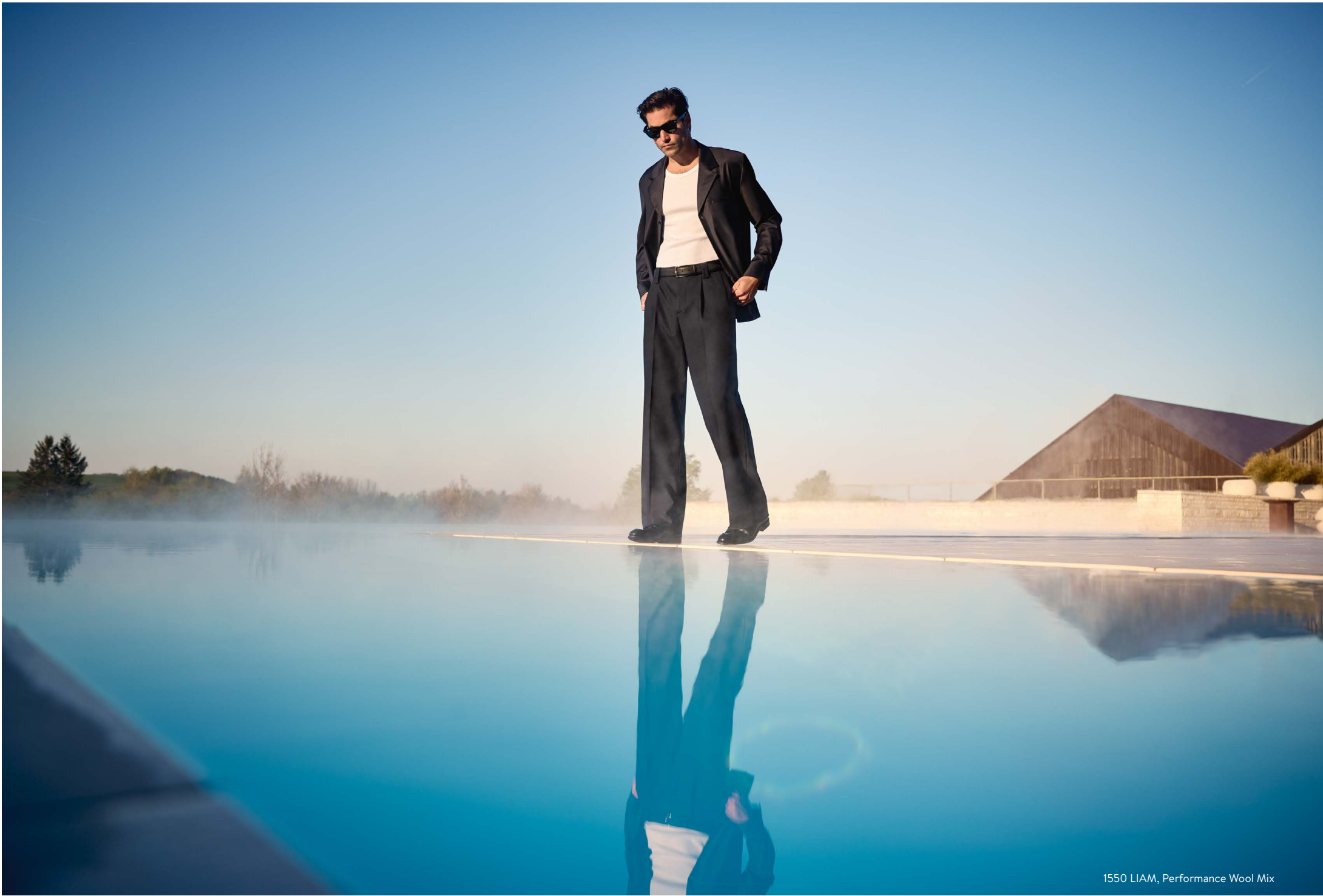
1550 LIAM, Performance Wool Mix

Palazzo pants are some of the hottest key pieces right now. And for good reason. These pants, with their wide cut and flowing fabrics, aren't just casual and elegant, they're also super comfy. For summer 2026, ALBERTO has given this style an elaborate makeover with a brand new model – and it's quite something. Finished with precisely placed creases and double pleats, as well as an elasticated waistband with concealed hook fastening and internal button placket, the 'Liam' adds an ultra-modern twist to the classic high-waisted, wide-fit look. And because ALBERTO wouldn't be ALBERTO if style didn't go hand in hand with function, this bi-elastic statement piece made from lightweight virgin wool is not only crease-resistant, colourfast and lightfast, but also offers cooling properties. This makes it the perfect choice for both holidays and business.