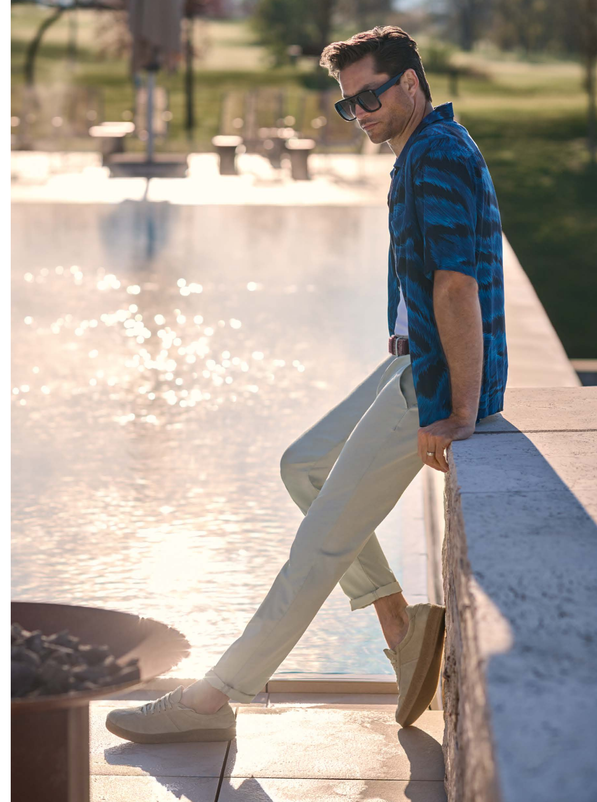
1506 LOU-J-GU, Light Cotton

When it comes to looking cool and well-dressed even in the heat of summer, experience shows that some fashion tweaks are a must. Luckily, ALBERTO has just the right answer to the question of what pants to wear. For the 2026 summer season, the Mönchengladbach-based company is presenting a stylistically and materially diverse range of Bermuda shorts and slacks that combine perceived lightness with visual lightness – ultra-modern, highly functional, mega-comfortable, emphatically sporty and, as always, crafted with meticulous attention to detail. Just slip them on and feel good, no matter how high the thermometer climbs!